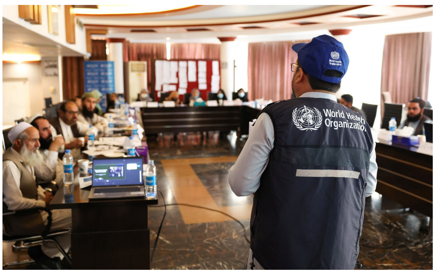
Risk communication and community engagement (RCCE) Training in Kabul on 18-20 September 2023