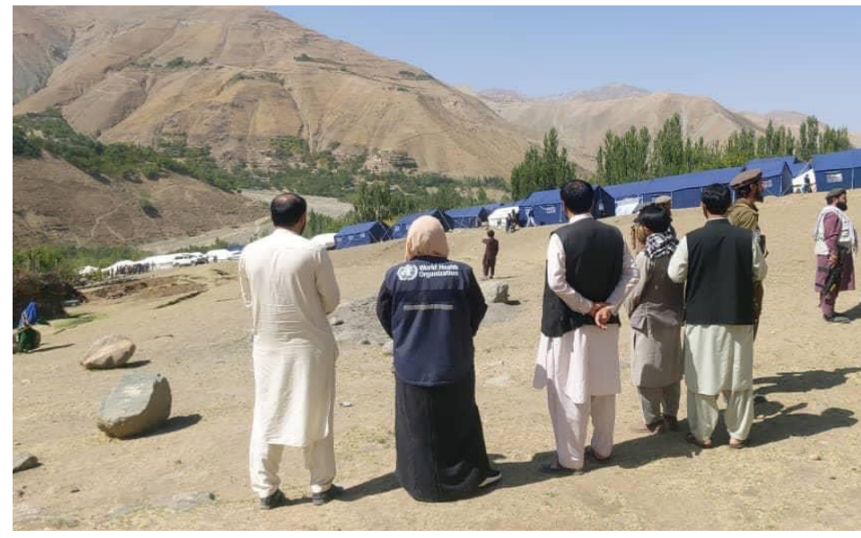
WHO deployed emergency medical support to the landslide-affected communities in the Yawan district of Badakhshan Province.